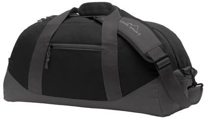
Eddie Bauer® Medium Ripstop Duffel