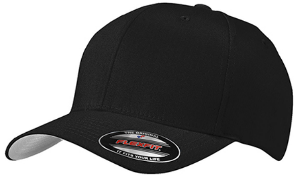
Port Authority® Flexfit® Cap