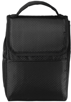
Port Authority® Lunch Bag Cooler