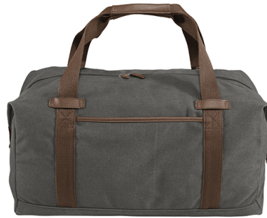
Port Authority® Cotton Canvas Duffel