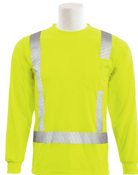
CLASS 2 BIRDSEYE MESH LONG SLV SEGMENT T