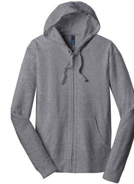
District® Jersey Full-Zip Hoodie