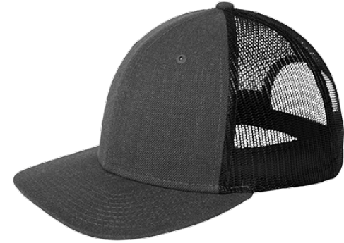
New Era® Snapback Low Profile Trucker Cap