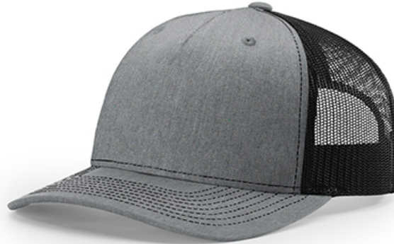
RICHARDSON FIVE PANEL TRUCKER