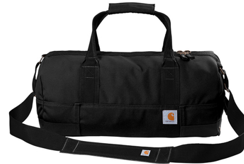
Carhartt® Foundry Series 20" Duffel