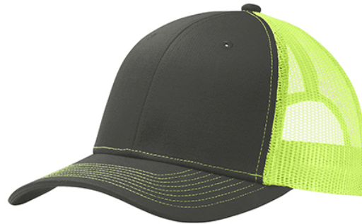
Port Authority® Snapback Trucker Cap