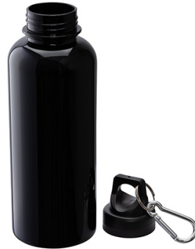
Brio 20 oz. PS Water Bottle w/ Carabiner KW1203W