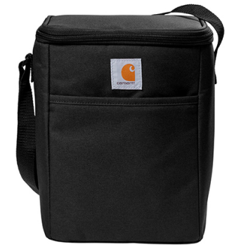
Carhartt® Vertical 12-Can Cooler