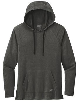
New Era® Tri-Blend Hoodie