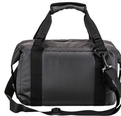
Basecamp Highland Peak Cooler