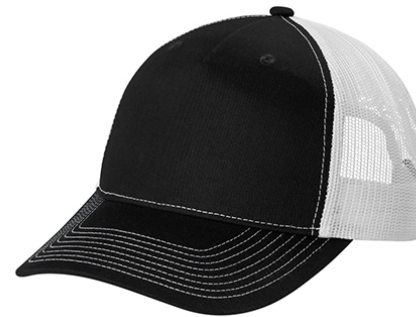
Port Authority® Snapback Ponytail Trucker Cap