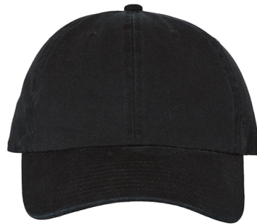
47 Brand Clean Up Cap