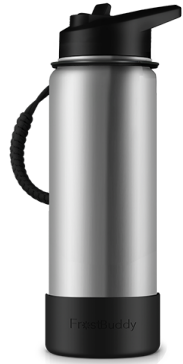
Frost Buddy® 40oz Sports Buddy FB401