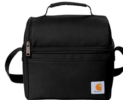
Carhartt® Lunch 6-Can Cooler