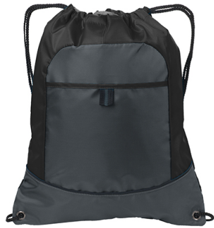
Port Authority® Pocket Cinch Pack