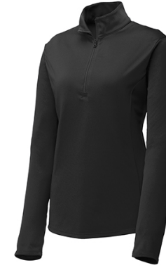
Sport-Tek® Ladies PosiCharge® Competitor™ 1/4-Zip Pullover