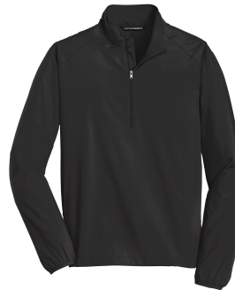
Port Authority® Zephyr 1/2-Zip Pullover