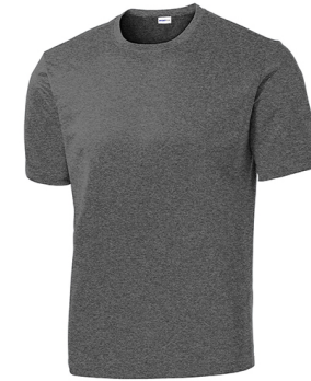
Sport-Tek® PosiCharge® Competitor™ Tee