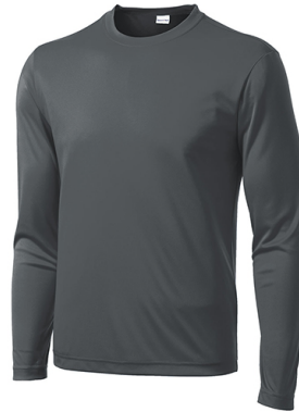
Sport-Tek® Long Sleeve PosiCharge® Competitor™ Tee