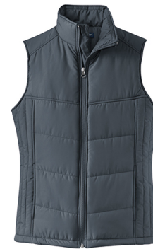
Port Authority® Ladies Puffy Vest