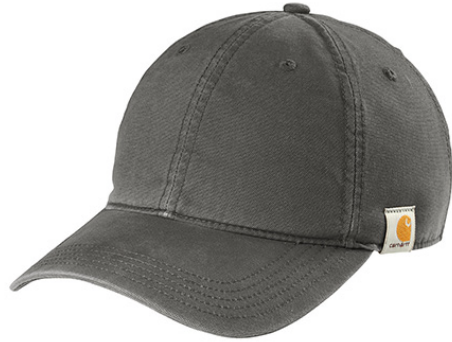
Carhartt® Cotton Canvas Cap