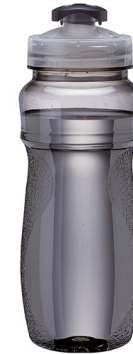
Forte 24 oz. PET Water Bottle KW2310B