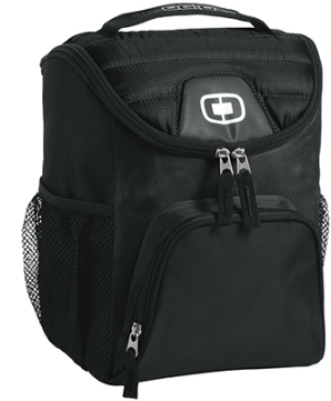
OGIO® - Chill 6-12 Can Cooler