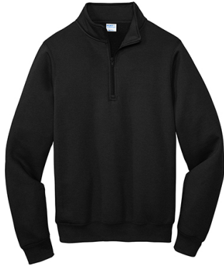
Port & Company® Core Fleece 1/4-Zip Pullover Sweatshirt