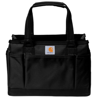
Carhartt® Utility Tote