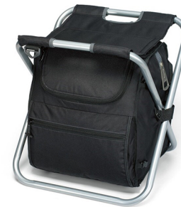
Deluxe Spectator Cooler Chair