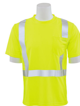
CLASS 2 BIRDSEYE MESH SHORT SLV T-SHIRT