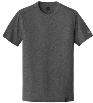
New Era® Heritage Blend Crew Tee