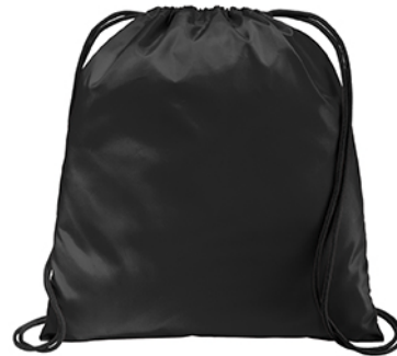
Port Authority® Ultra-Core Cinch Pack