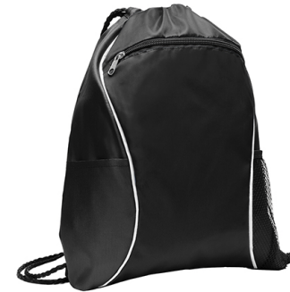
Port Authority® Fast Break Cinch Pack