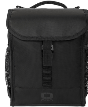
OGIO® Sprint Lunch Cooler