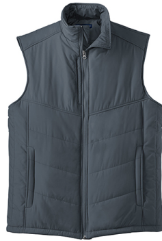
Port Authority® Puffy Vest