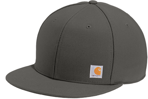
Carhartt® Ashland Cap