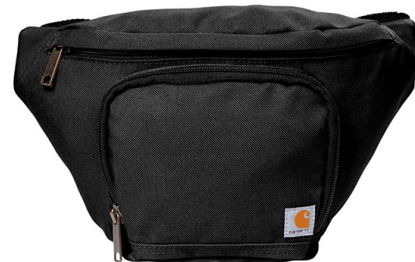
Carhartt® Waist Pack