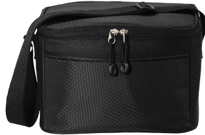
Port Authority® 6-Can Cube Cooler