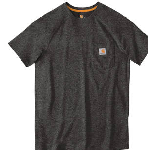
Carhartt Force® Cotton Delmont Short Sleeve T-Shirt