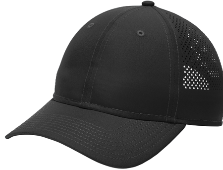
NEW ERA® PERFORATED PERFORMANCE CAP