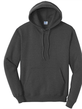
Port & Company® Core Fleece Pullover Hooded Sweatshirt