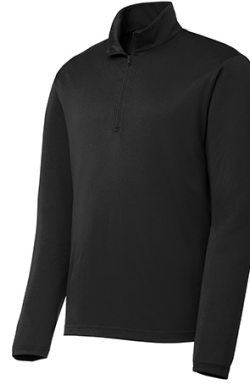
Sport-Tek® PosiCharge® Competitor™ 1/4-Zip Pullover