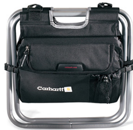
Spectator Cooler Chair