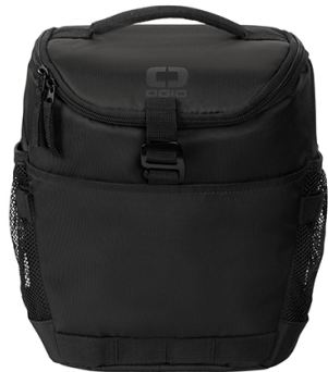
OGIO® Sprint 12-Pack Cooler