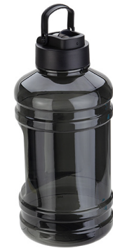
Hercules 75 oz Water Jug DBT - HC21