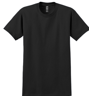
Gildan® Ultra Cotton® 100% US Cotton T-Shirt