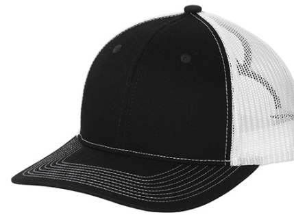
Port Authority® Snapback Five-Panel Trucker Cap