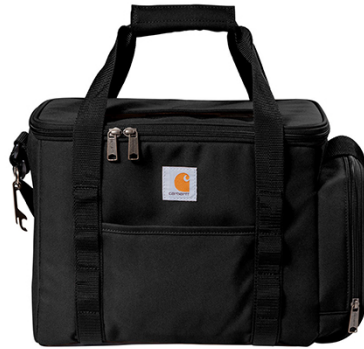
Carhartt® Duffel 36-Can Cooler